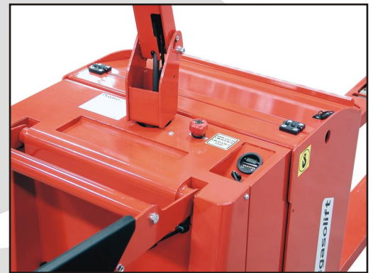
Protected instruments and shelf box