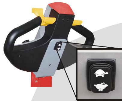
Speed Selector for slow/fast speed