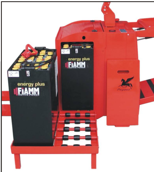
Quick Battery Change version