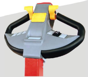
Also available in Cold Store Version -30°C