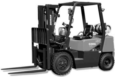
G20G / G25G / G30G 2,000kg 2,500kg 3,000kg Gas, LPG, Pneumatic Tire