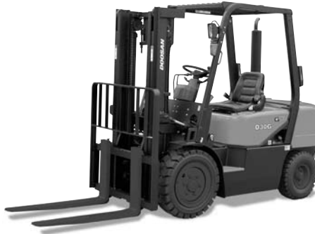
D20G / D25G / D30G 2,000kg 2,500kg 3,000kg Diesel, Pneumatic Tire