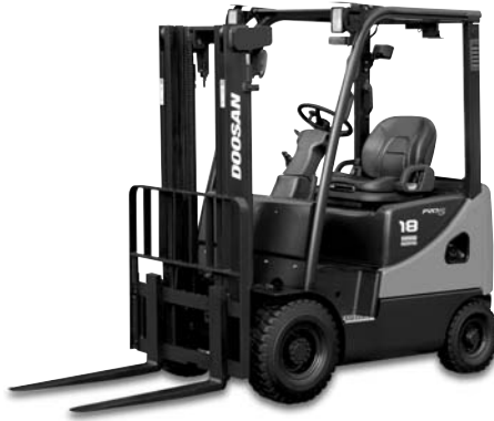
D15S / D18S-5 & D20SC-5 1,500kg 1,750kg 2,000kg Diesel, Pneumatic Tire