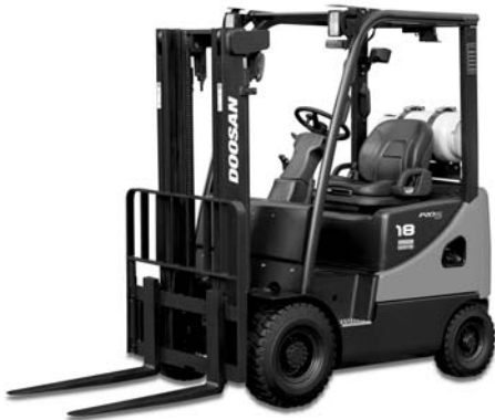
G15S / G18S-5 & G20SC-5 1,500kg 1,750kg 2,000kg LP, Pneumatic Tire